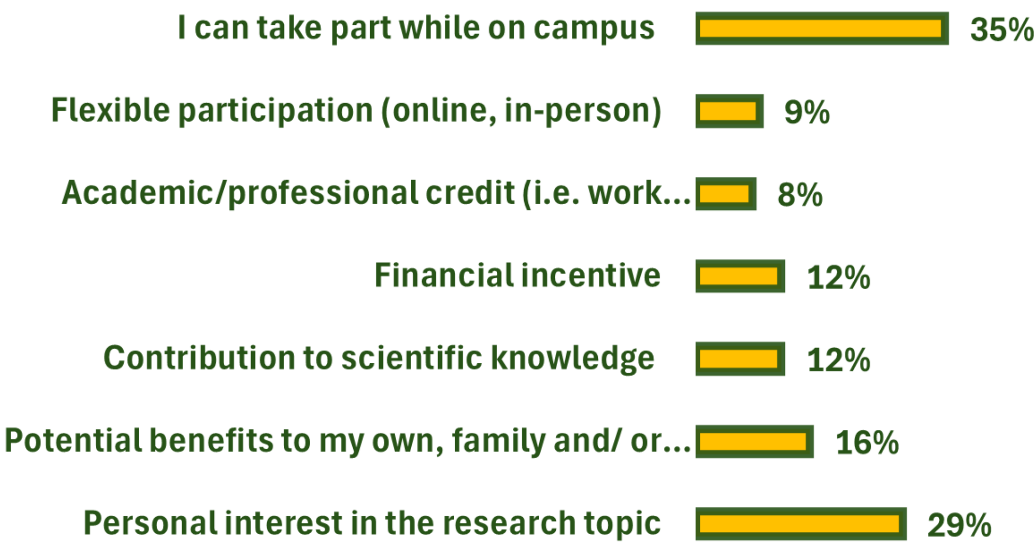
Figure 4: Responses to the Question: 'What Would Most Encourage You to Take Part in Health Research?' (n = 126). This figure presents the various factors that students identified as key motivators for their participation in health research