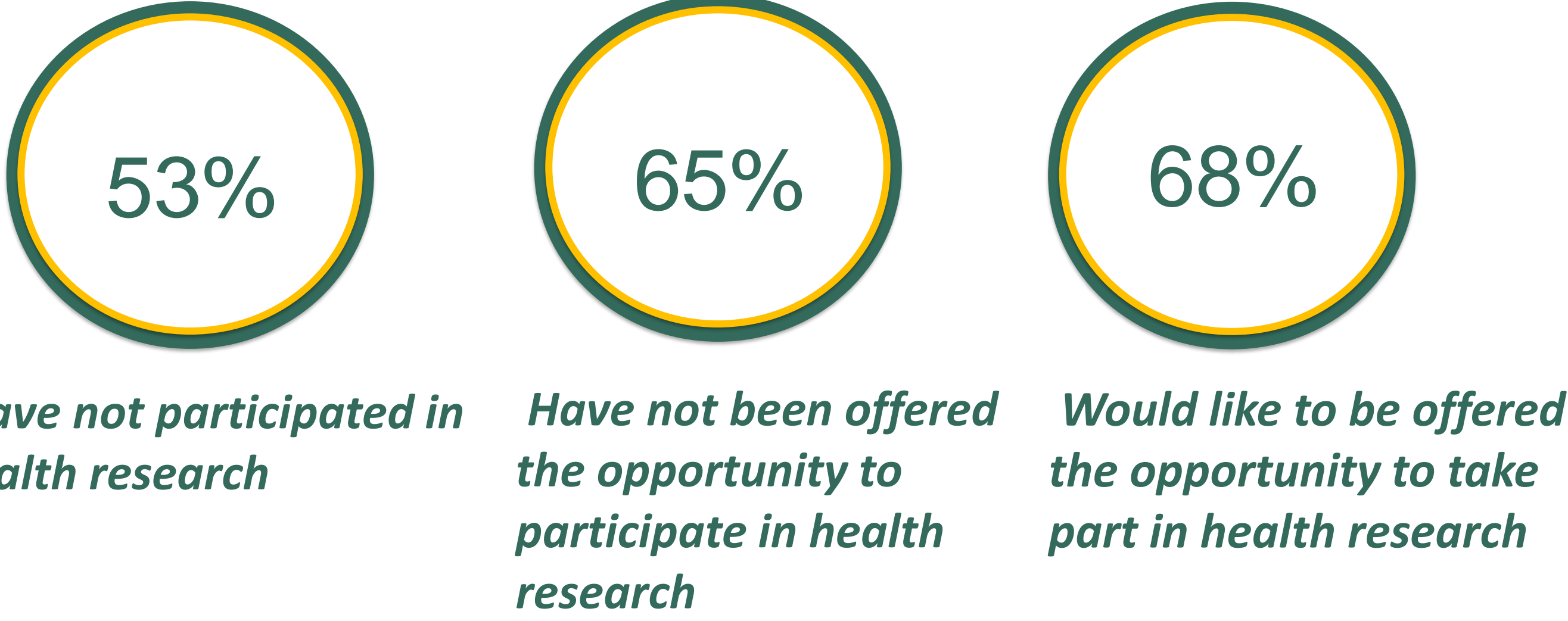
Figure 3: Percentage Breakdown of Student Responses to Research Experience and Health Research Participation Questions (n = 126). This figure illustrates the percentage distribution of student responses to three key questions: (1) Which statement best describes your research experience? (2) Have you ever been offered the opportunity to take part in health research? (3) Would you like to be offered the opportunity to take part in health research? The data provides insights into students' research backgrounds, previous opportunities, and interest in future health research participation.