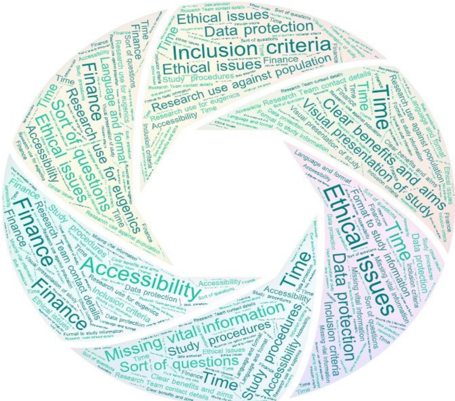
Figure 5: Word Cloud of Students' Reasons for Not Participating in Research (n = 126). This word cloud visualises the various reasons students provided for not engaging in research activities.